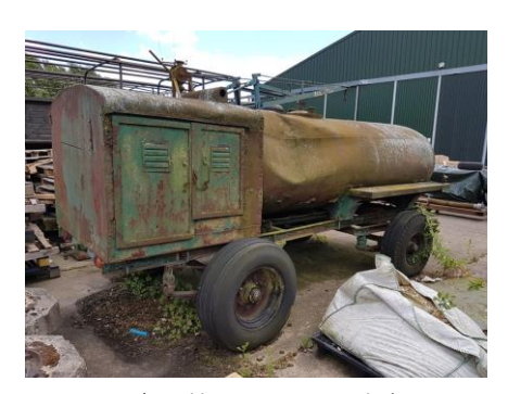
(Brockhurst Bowser Trailer)