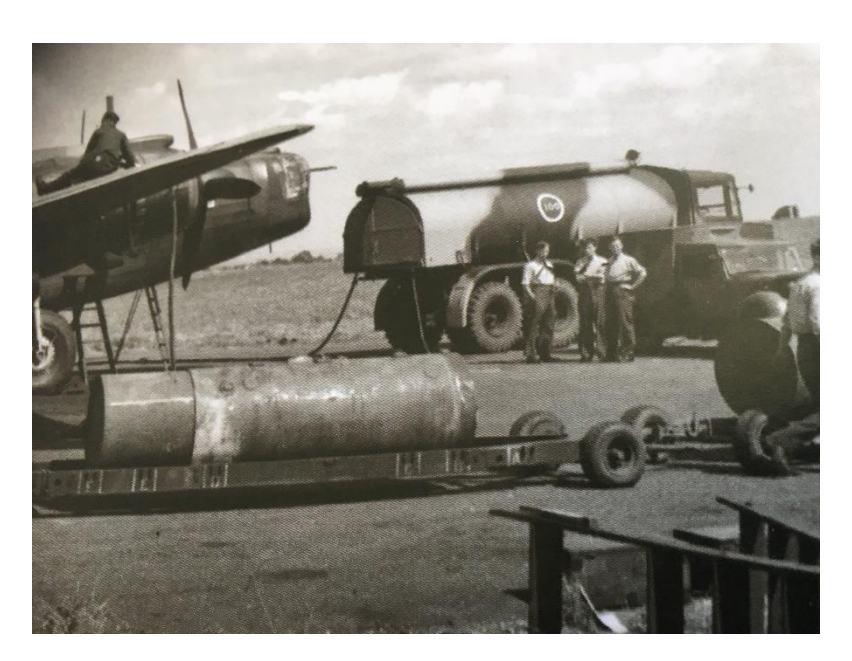
Wellingtons being readied for a raid at RAF Ingham

Pathfinders marked the target and the Wellingtons bombed from heights of 13,000 feet and higher, at just after 0100 hours in the morning. Serious damage was done to the target, with 94% being destroyed. Over 170 Industrial premises and some 3,000 domestic premises were hit. Out of a total of 630 aircraft 100 Wellingtons were involved and six went missing.