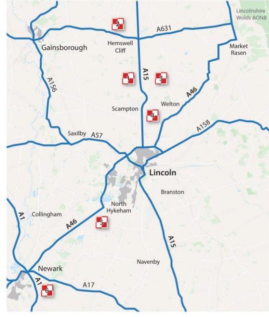
1) RAF Ingham 2) RAF Hemswell 3) RAF Faldingworth 4) RAF Dunholme Lodge 5) RAF Swinderby 6) Newark Cemetery