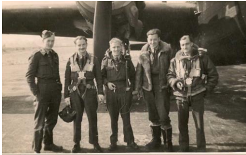
The Squadron's motto is, 'Let Tyrants Tremble'

The second local connection happened over 20 years later during ww2, when 199 Sqn was reformed on 7 Nov 1942. This time flying Vickers Wellingtons, at RAF Blyton, some 7-8 miles north-west of RAF Ingham.